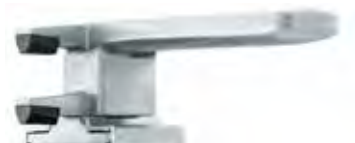
Non-marking lock tabs

Constructed from solid, 316 marine-grade stainless steel. Available in high profile (vented) or low profile options. Non-marking moulded nylon tips.