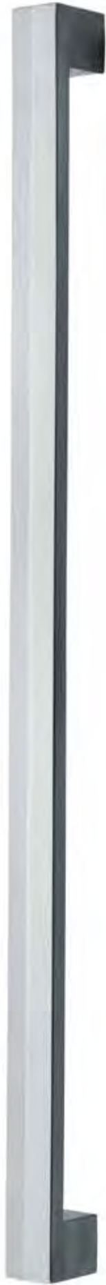
Entrance Pull Handle